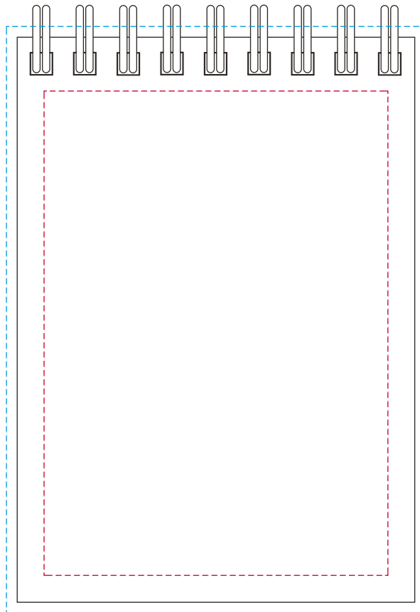
Each Sheet Reverse