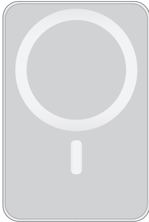
TYPE C PORT