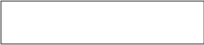
Back (extra charge)