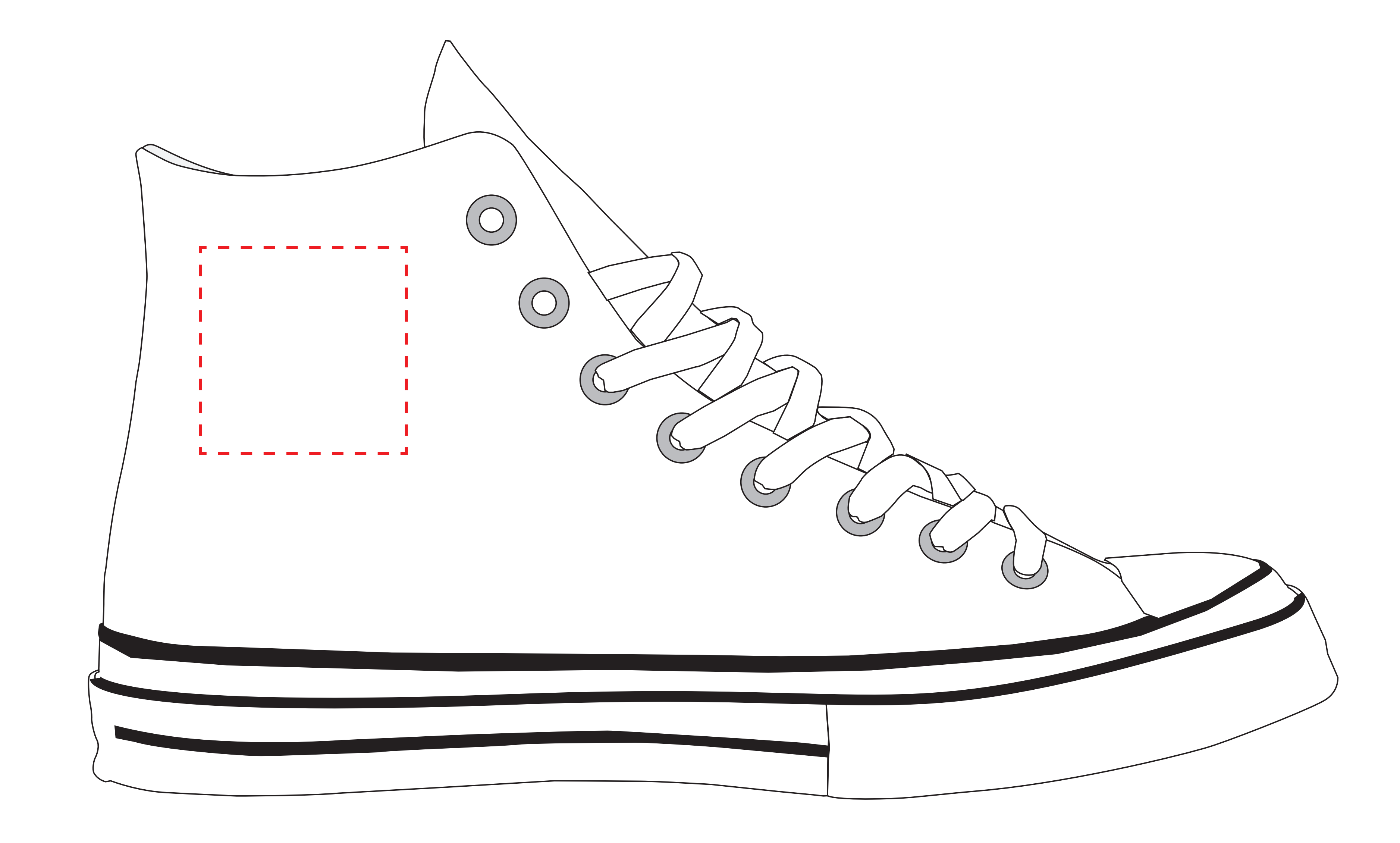
OUTSIDE OF RIGHT SHOE