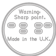
REVERSE OF MOULDING