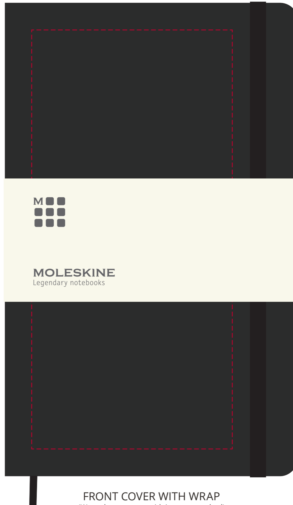
FRONT COVER WITH WRAP (Wrap shown comes with item as standard)

Scale 100% Print area 89 x 186 mm Logo size xx x xx mm