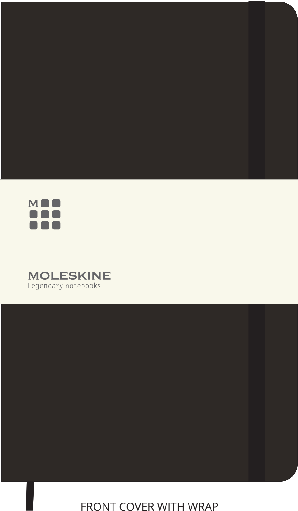
FRONT COVER WITH WRAP (Wrap shown comes with item as standard)