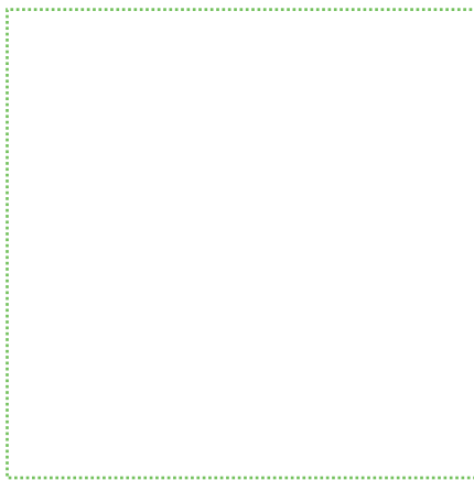
Artwork scale: 25% Max print area: 225 x 225 mm