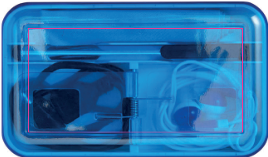
3. TOP SIDE